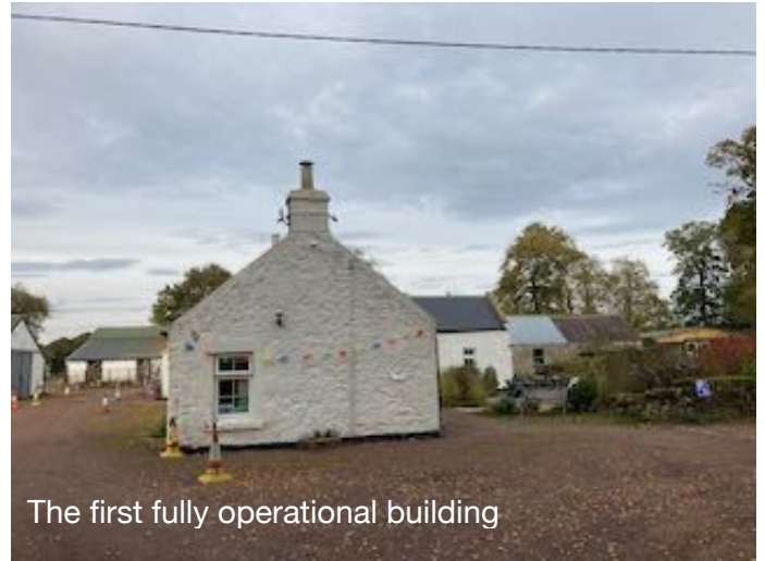
The first fully operational building

There's a new patio by James and several tables by Keith for the warmer weather. We have several very skilled staff and volunteers. The Main dining area, one of our smaller rooms is also currently used for meetings, activities, and talks. How the spaces will be used in the future will be decided as our needs become clearer, so flexibility is being built in.